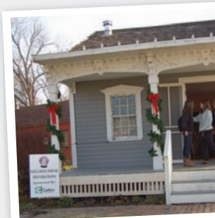
A Country Christmas