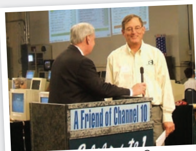
Channel 10 Auction Sponsor