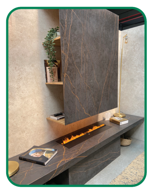
Dekton Fireplace Facade

Much time was spent in the Inspiria Lab, where there are designated rooms for developing new designs, colors, finishes, and testing materials. The entire lab, including the building's exterior, was made of Dekton, a mixture of more than 20 minerals extracted from nature, a decoded stone. Dekton inspires the future of architecture and design by creating soulful spaces where beauty and functionality coexist.